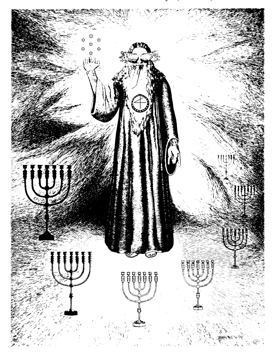
FIGURE 6.2 Ancient of Days (Peshitta)

When the connection is opened via nirvikalpa samadhi to the substratum of the Ayn , everything disappears, including the idea of the substratum. You discover that none of this ever existed, none of this ever happened. It's like waking up from a dream. When you wake up from a dream, where does the dream you were having go? All the programming is completely shattered by this realization, always. You can only continue by leaving a copy of your program in Small Face BEFORE you access the