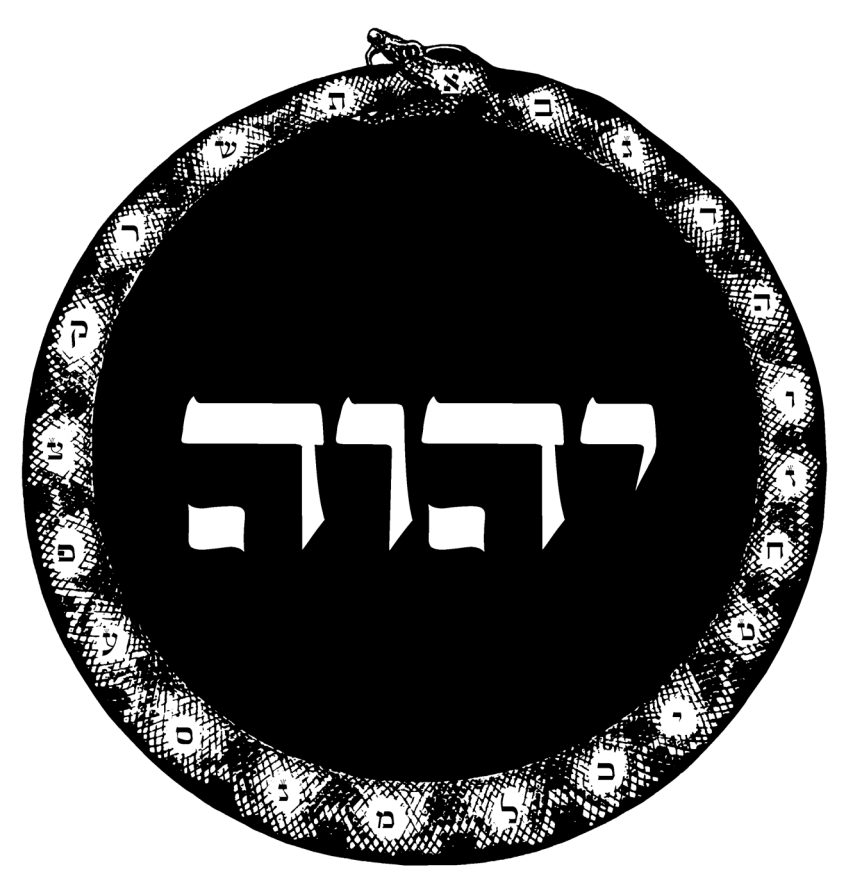
FIGURE 6.1 Horizontal Ezra on the Tzimtzum surrounded by Leviathan

Compared to the Hermetic and Religious Qabalah, the Mystical Qabalah is relatively fluid. Within certain parameters, it allows considerable flexibility in the choice of practices and how