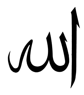
FIGURE 1.2 Name Allah

The silent and oral recitation (dikhr) of the "Affirmation of Unity" (La Illaha Il Allah), which is the root mantra at the foundation of Islam, is a core practice of all Sufis. The various orders can often be distinguished by the way that they do this. Moses Maimomades, the oft-cited author of The Guide for the Perplexed , regarded the Affirmation of Unity of the Qur'an as essentially equal to the Affirmation of Unity of the Torah, "Shem Avin Yisrael הבוד Elohenu ברות EchaD." Maimomedes made this declaration actually believing this to be the case, and not just because the alternative was death. Sufis are also known for movement practices, called dervishes, which vary from order to order.<sup>33</sup> These dervishes usually involve some combination of movement, breath, and repetition of Divine Names. The Jewish Kabbalist Abraham Abulafia may very well have adopted some of the head movements he employed with letter visualization practices from the Sufis who were his contemporaries in Spain.<sup>34</sup>